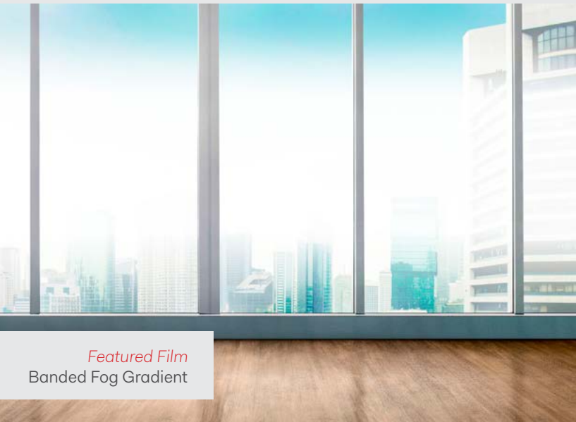
Featured Film Banded Fog Gradient