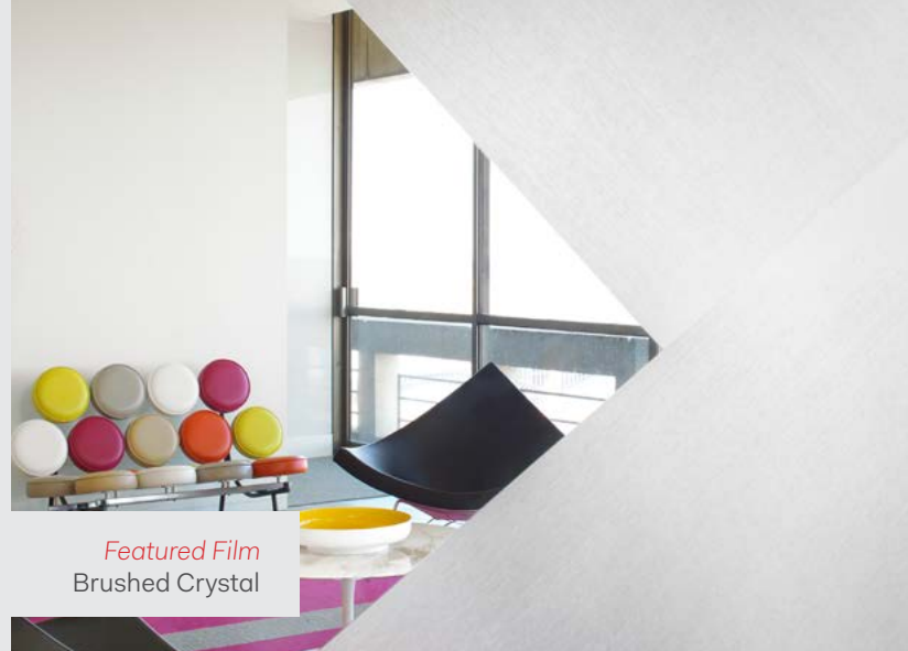
Featured Film Brushed Crystal

An abundance of light flows through every style offered in this elegant collection, including several satin crystal effects and a shimmering, simulated sparkle.