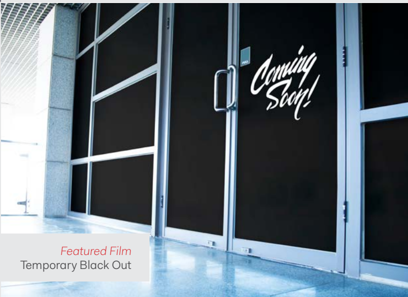
Featured Film Temporary Black Out

Transform any glass surface into a stunning statement: partitions, windows and sliding glass doors are just the beginning. Try colors alone to create distinctive moods, layer multiple films for interesting effects, or combine with custom cutting for one-of-a-kind effects.