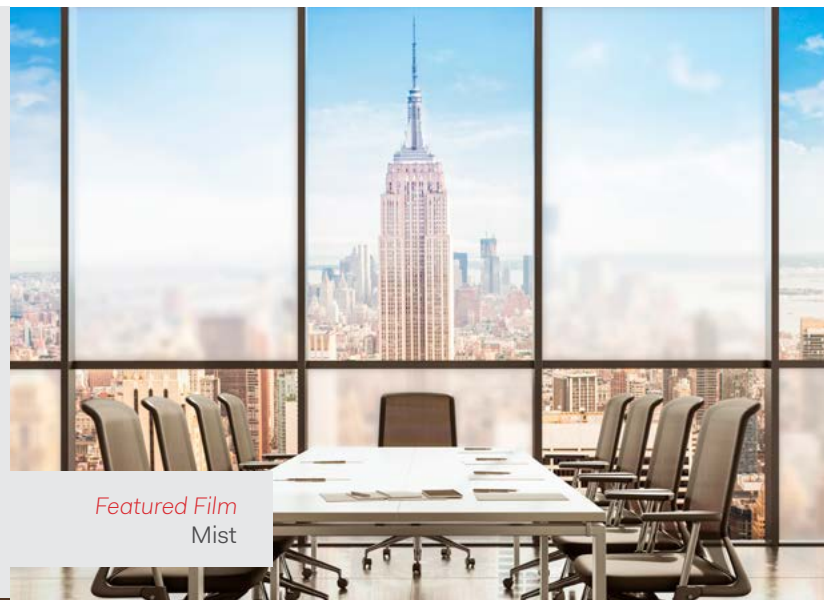
Featured Film Mist

This series is a solution for architectural styles from formal to casual and modern to historic, and its understated versatility is an invitation to experiment. Imagine creating one-of-a-kind artwork by combining matte frosts with custom cut logos, dramatically colored specialty films and more.