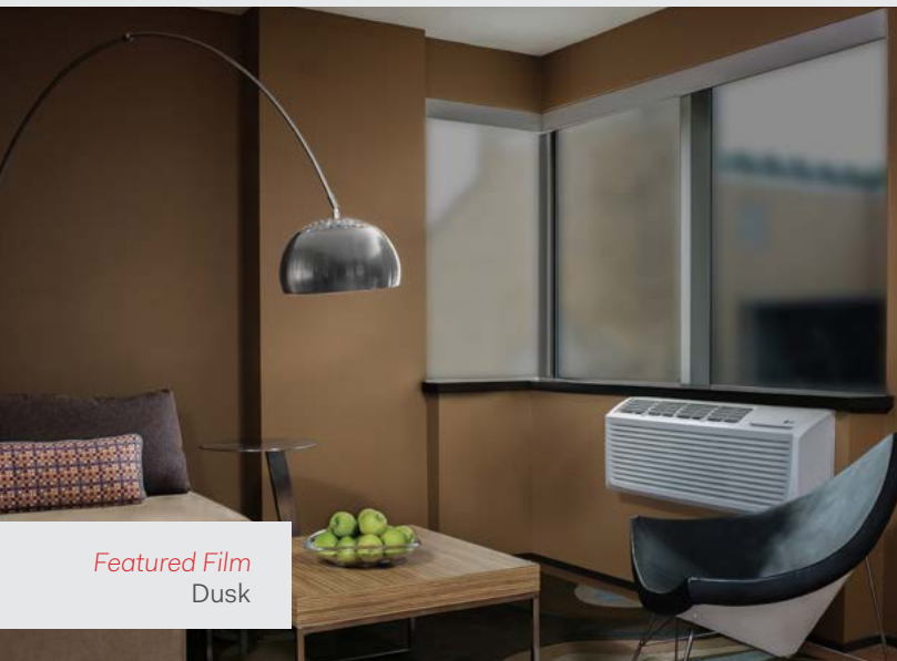
Featured Film Dusk