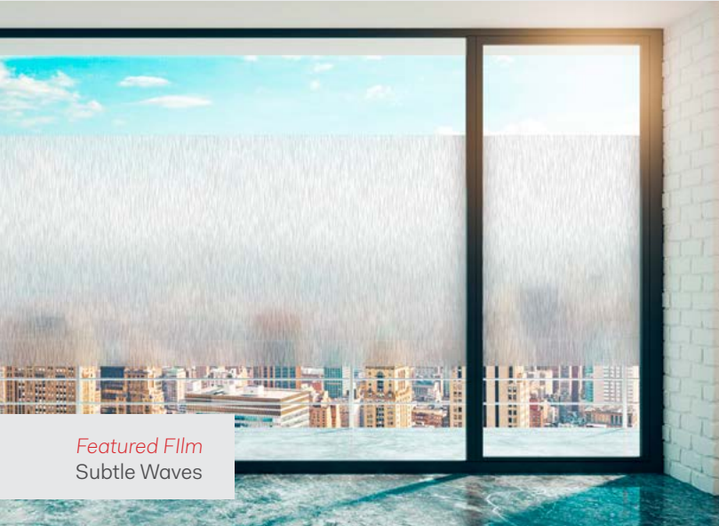
Featured Film Subtle Waves